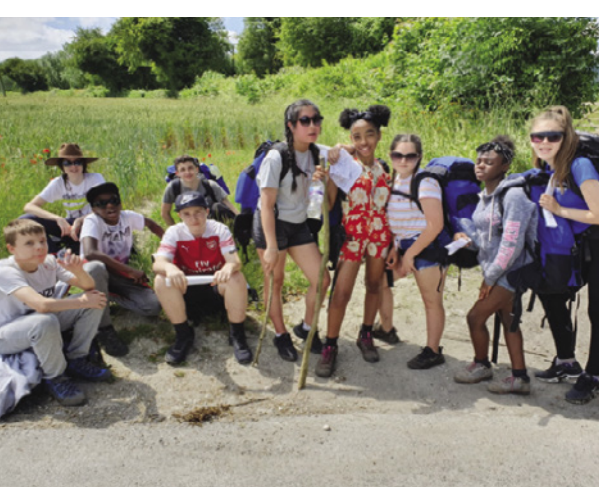
It is a great source of pride for our school community for these students to have completed their Duke of Edinburgh Bronze award this term – well done to all involved!